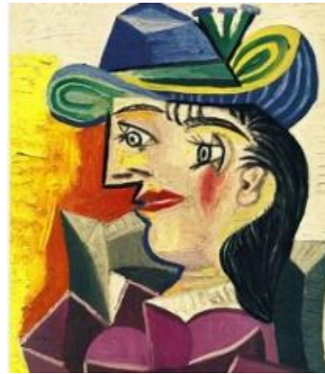
Pablo Picasso – Woman with a blue hat