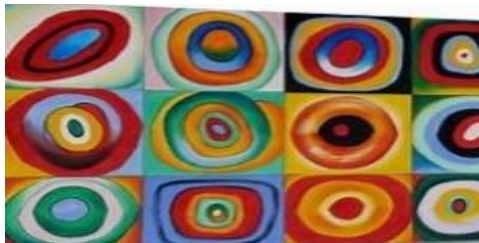
Kandinsky – Concentric Circles