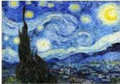
Van Gogh – Starry Night