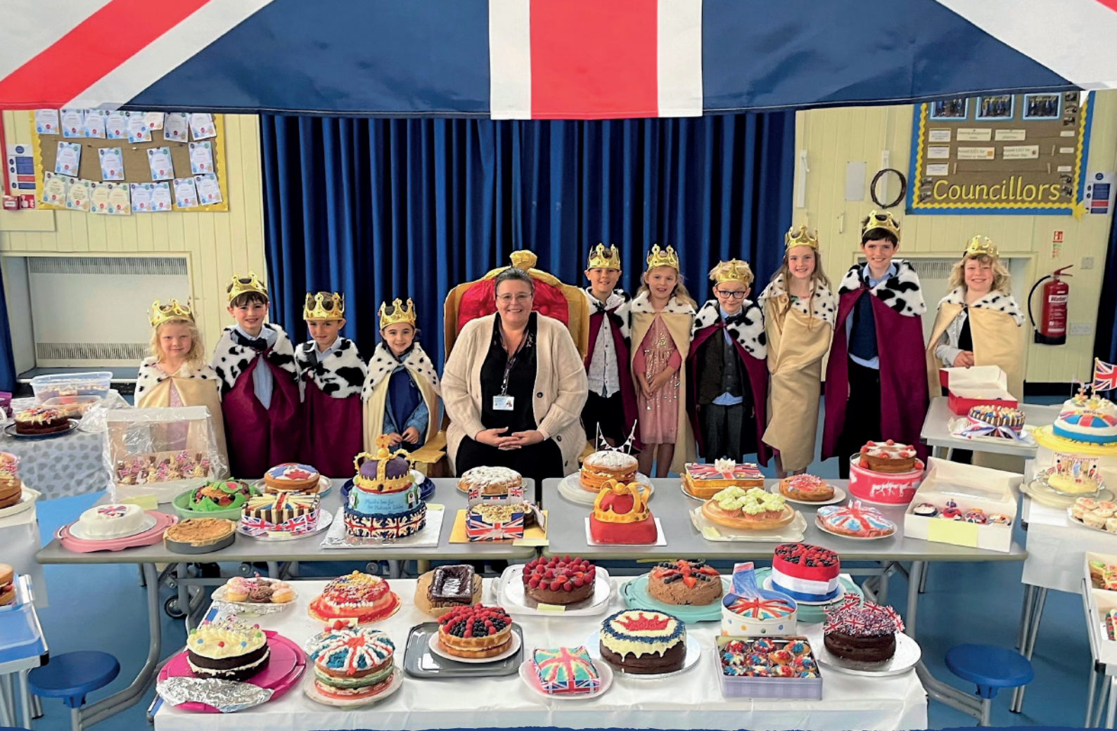
Springdale First School celebrating the Queen's Platinum Jubilee in June 2022.